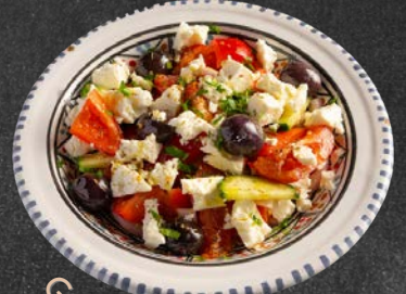
Greek Salad €8