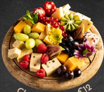
Cheese Platter €12