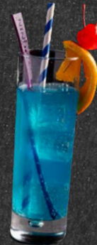
BLUE BREEZE 7.50

Non Alcoholic Sugar Cane Syrup, Blue Curacao Syrup, Lemonade