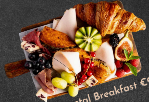
Continental Breakfast €9