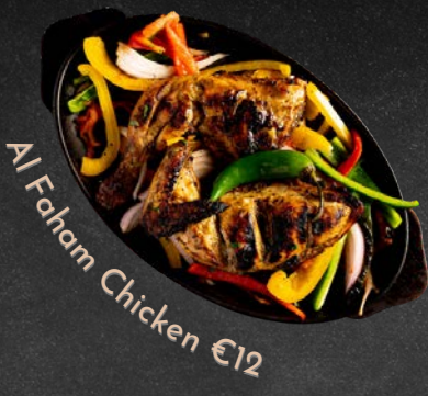
Al Faham Chicken €12