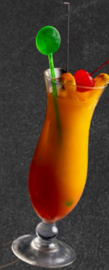
TEQUILA SUNRISE 7.50

Jack Daniels, Bajtra Liquer, Orange Juice