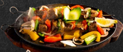
Beef Kebab €13