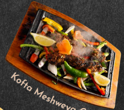
Kofta Meshweya €11