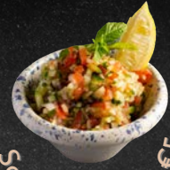
Salatha Lebeya €5