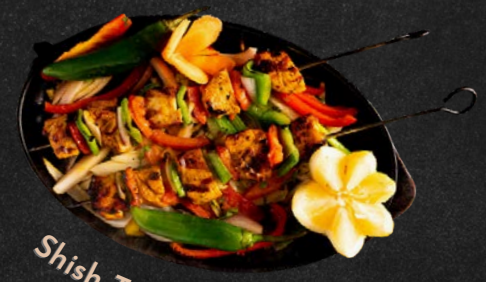
Shish Taouk €12