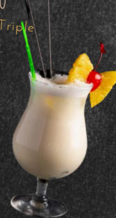
PIÑA COLADA 7.50

White Rum, Malibu, Coconut Syrup, Fresh Cream, Pineapple Juice