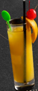
FORBIDDEN FRUIT 5.50

Tequila, Orange Juice, Dash Grenadine Syrup