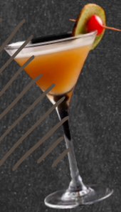
NINOU'S DELIGHT 6.00

Tequila, Blue Curacao, Triple Sec, Bitter Lemon