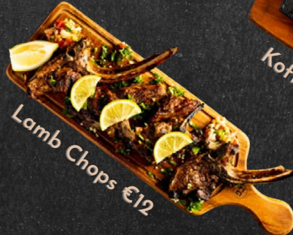
Lamb Chops €12