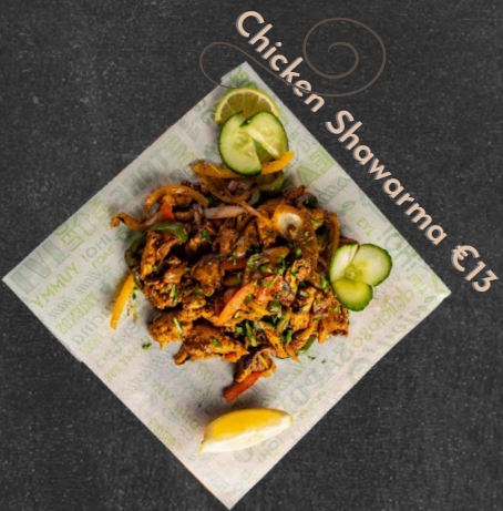
Chicken Shawarma €13