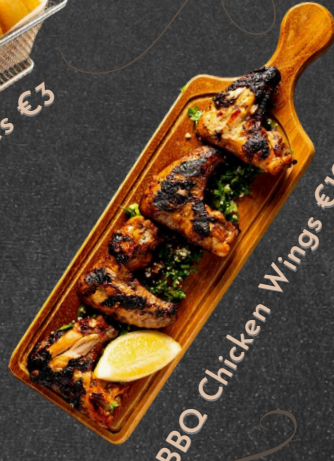
BBQ Chicken Wings €10