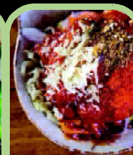
Mini Spicy Salmon Salad