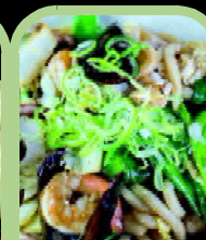
Seafood Yaki Udon