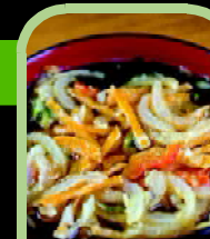
Kaki age Udon