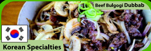
Beef Bulgogi Dubbab