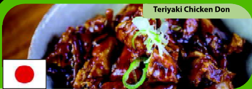
Teriyaki Chicken Don